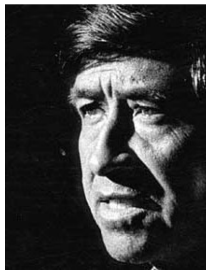
Cesar Chavez.